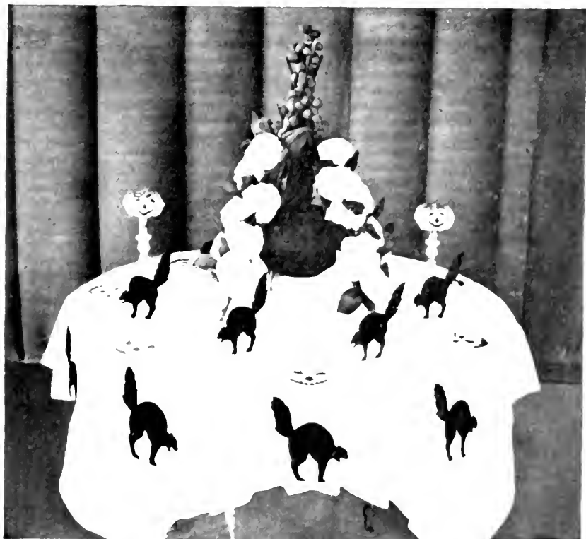
A BLACK-CAT TABLE. HALLOWEEN TABLES, II.