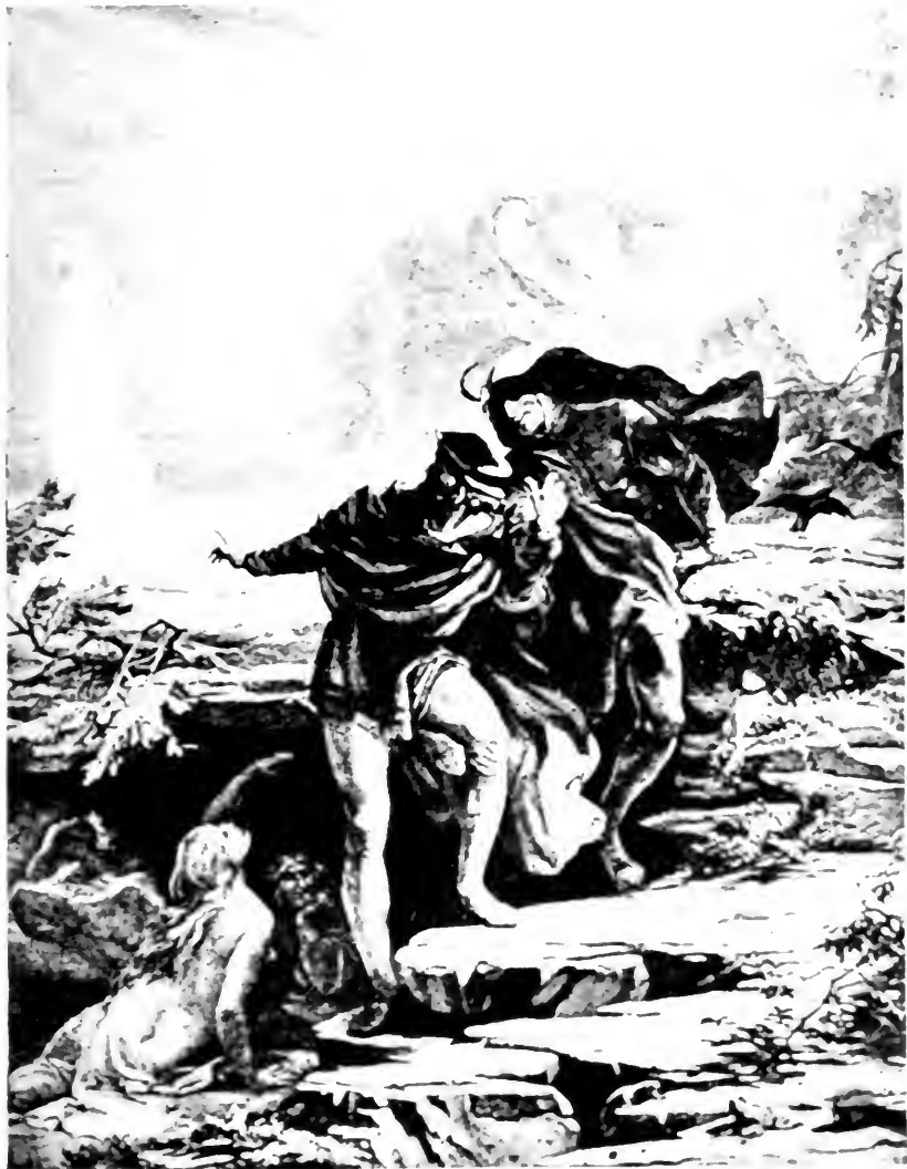
THE WITCHES' DANCE (VALPURGISSACHT.)