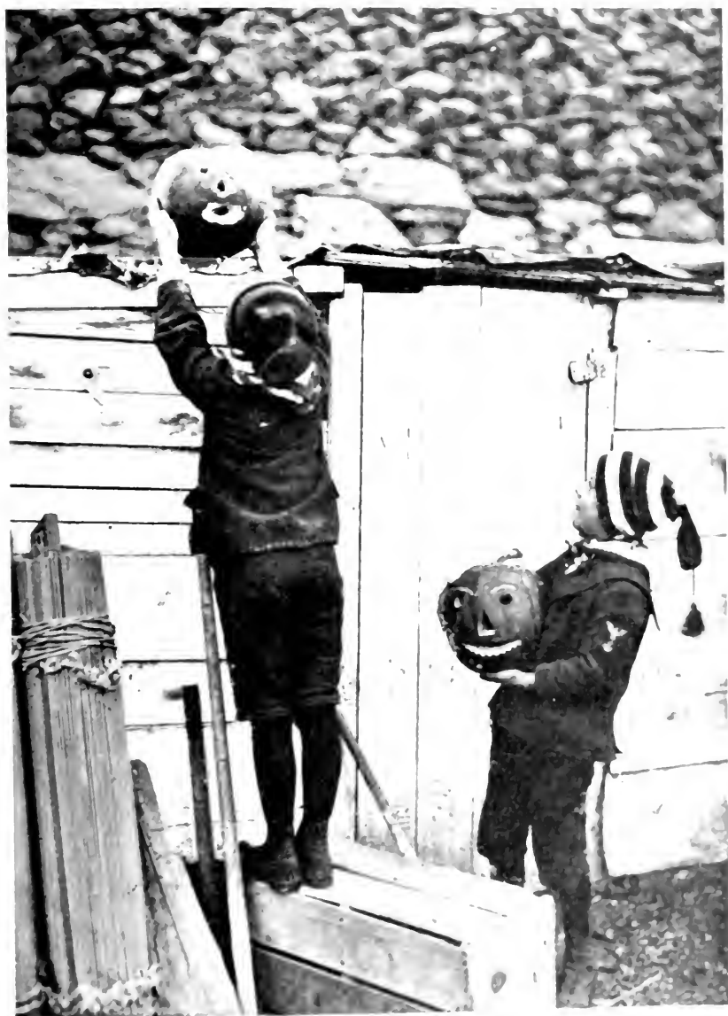
NO HALLOWEEN WITHOUT A JACK-O-LANTERN