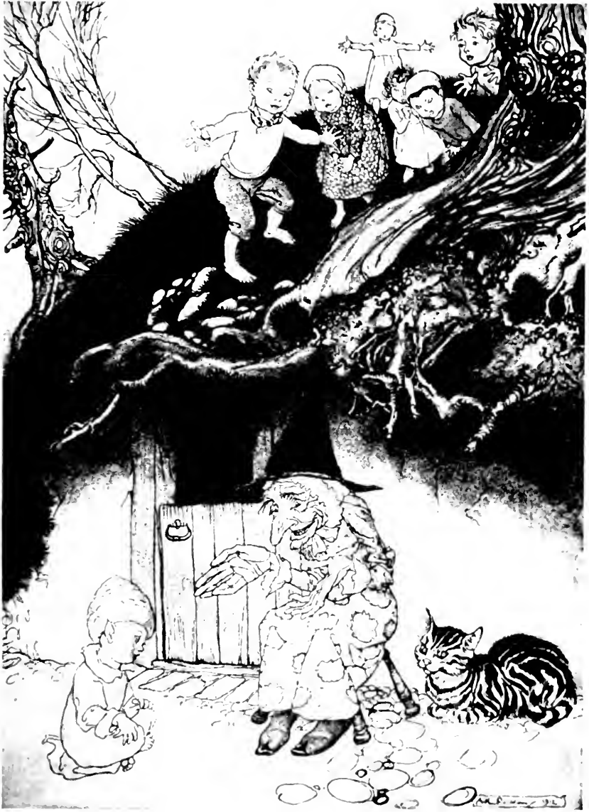
THE WITCH OF THE WALNUT-TREE.