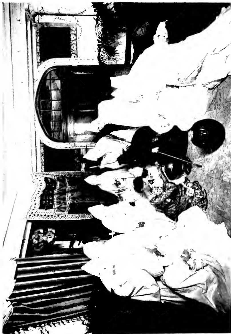
FIGURE 11. THEATRE.