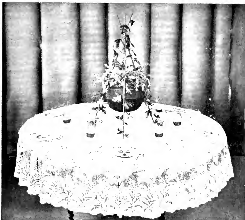
A WITCHES'-CALDRON TABLE.