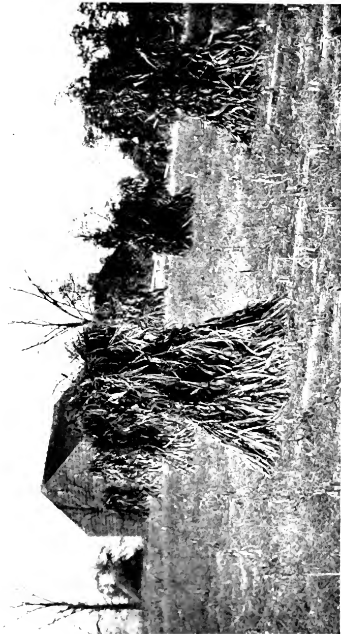
IN HALLOWEEN TIME.