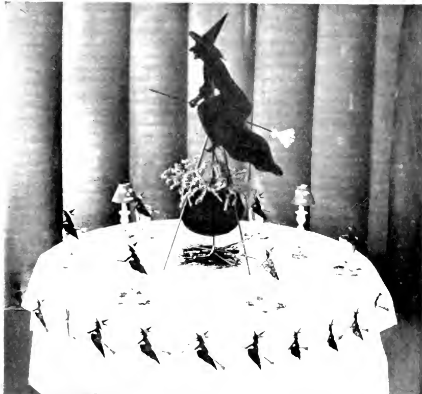
A WITCH TABLE.